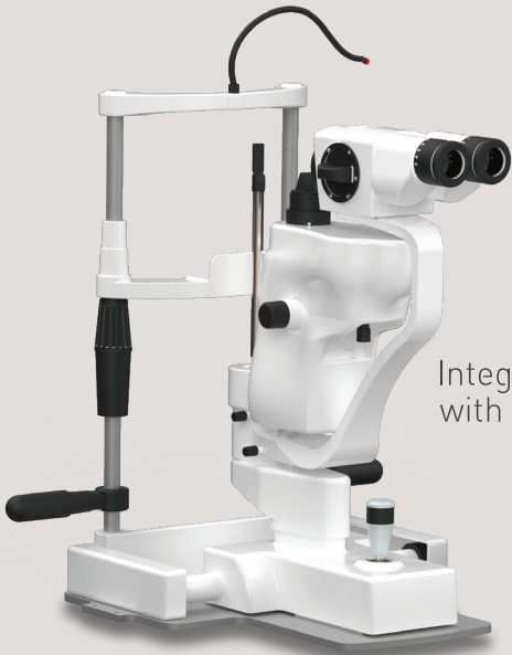
Integrated Slitlamp with 5 step Magnification