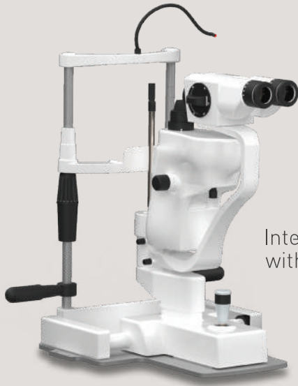
Integrated Slitlamp with 5 step Magnification